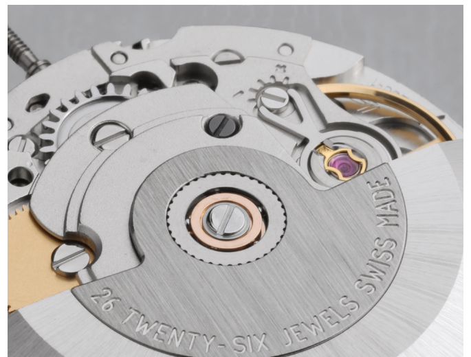
Figure 12. The Sellita SW200 movement, which powers anOrdain's watches.