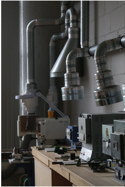
Figure 9. A bank of kilns in anOrdain's enamelling workshop.