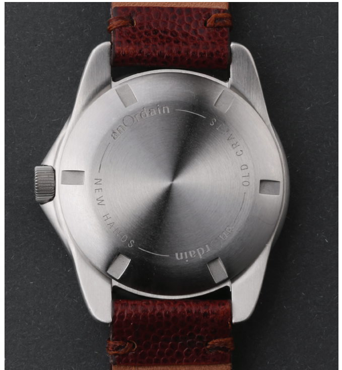
Figure 14. Rear view of the 'midnight green' Model 2.

artisans looking to hone their skills. They're the sort of company I look at and wish they'd been around when I was a graduate.