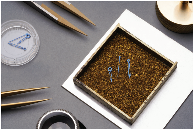
Figure 11. Bluing the steel hands, inspired by the shape of a compass needle.