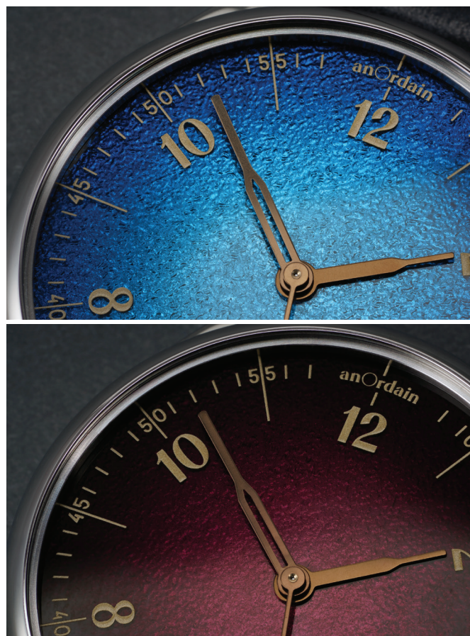
Figure 1. Details of the finished 'blue' and 'plum' fumé dials housed in the Model 1 case.

The process of vitreous enamelling requires the fusing of finely powdered glass on to metal using heat. Enamelling is one of those rare techniques that bridges nature and chemistry. The