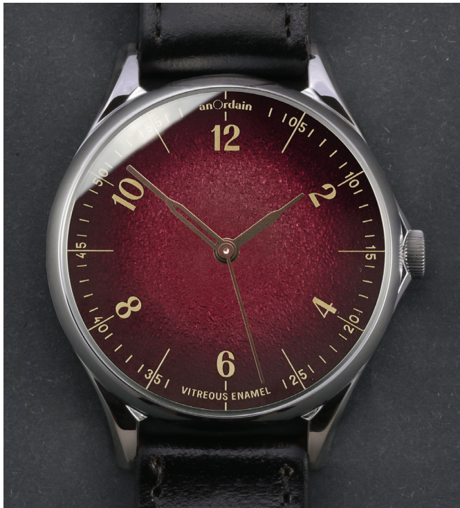
Figure 13. The finished 'plum' fumé dial housed in the Model 1 case.