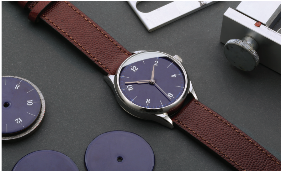
Figure 2. anOrdain's Model 1 with a Parisian blue enamel dial.

process is scientific, but the outcome is so easily influenced by natural variations, it makes the process as much of a battle between human and the elements as it is the scientific process of heating powdered glass. It's regarded as a kind of alchemy.